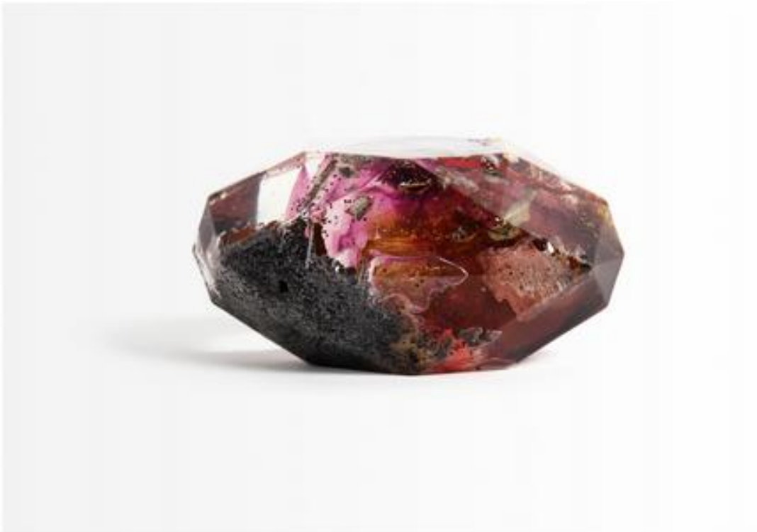
Psychic Stone – Everything