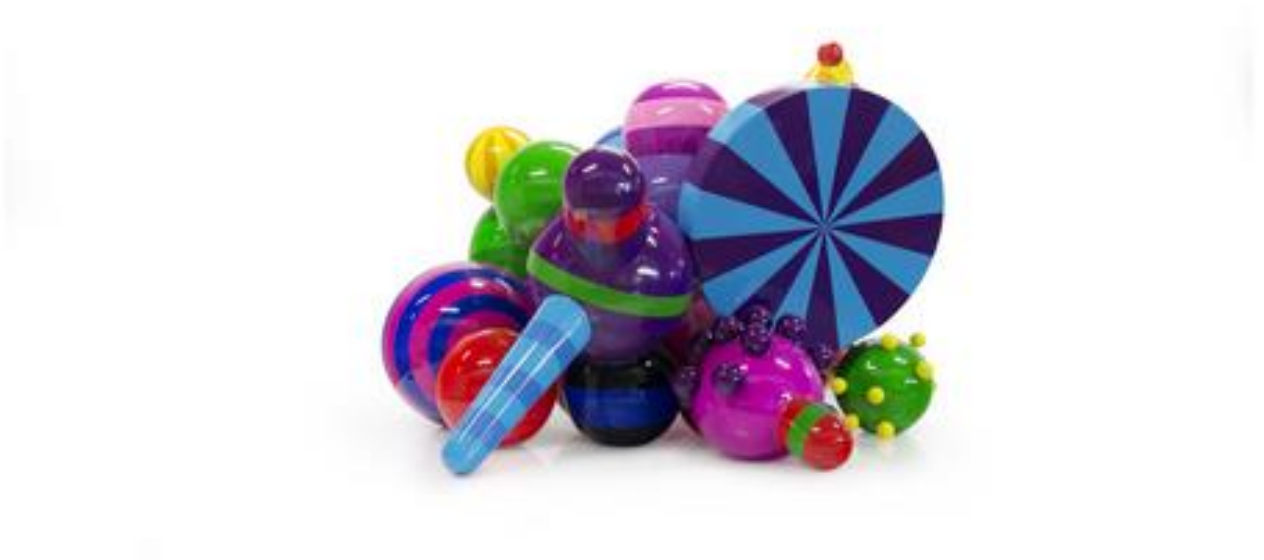
All The Wishes