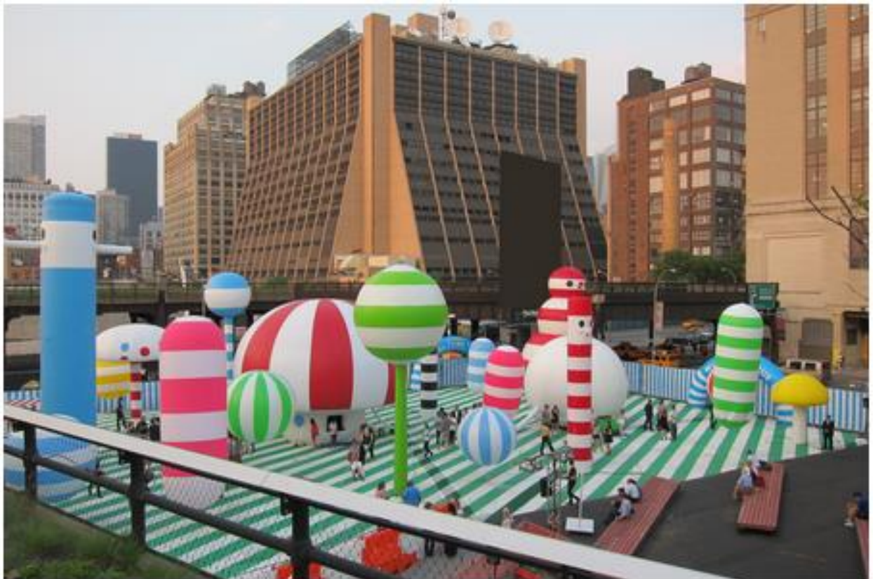
Rainbow City – NYC