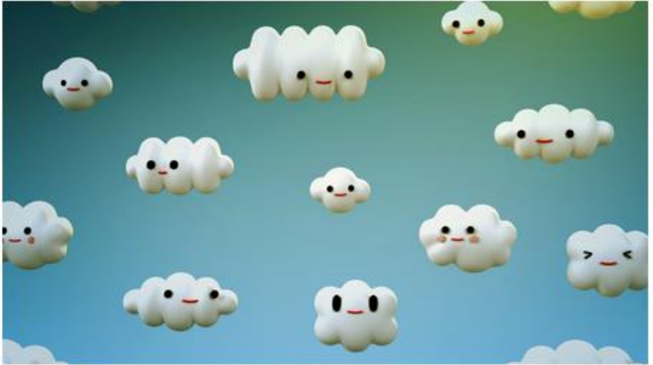
Cloudy Film Still