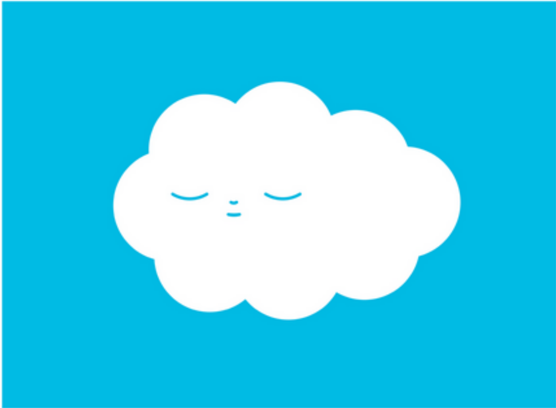
Little Cloud Print