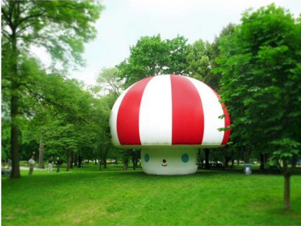
Mushroom Bounce House Rainbow City