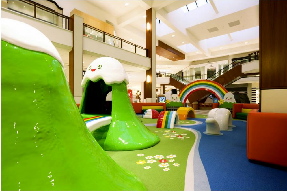
Rainbow Valley 2