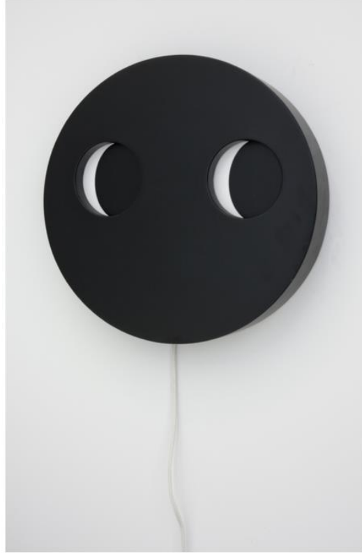
I See You